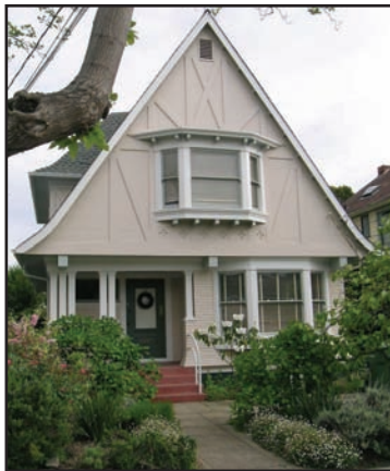
Stokes House.