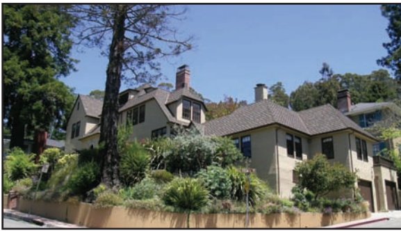
The Wells House. Carrie Olson, 2010.

kind, down to the wavy glass panes. Windows that were not beyond repair received a deep-tissue rehabilitation. The exterior was waterproofed with a limestone-infused paint from Austria. Inside, walls and ceilings in the major rooms received a hand-troweled treatment of waxed Venetian plaster. The attic space, previously unfinished, was turned into an airy sitting room inspired by the study on the main floor.