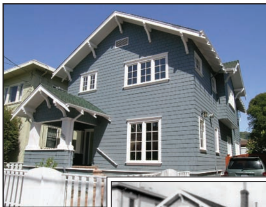
The Dildine House today. Daniella Thompson, 2010. The one-story original in 1939. Donogh File, BAHA Archive.

This one-story bungalow was situated on a block of two-story structures. The owners lived here for more than seven years before they were ready to start a family and wanted room to grow. The house was lifted, and a new ground floor constructed. The second floor retains the original proportions. Where windows were too decayed to keep, wooden replacements were made in the same style, and compatible windows and doors were installed on the new first floor. The front porch, although slightly larger, was built with 60% of the original, including the pillars. Instead of wooden shingle siding, a composite was chosen with an eye to easier maintenance. The expanded house now completes the skyline on this block.