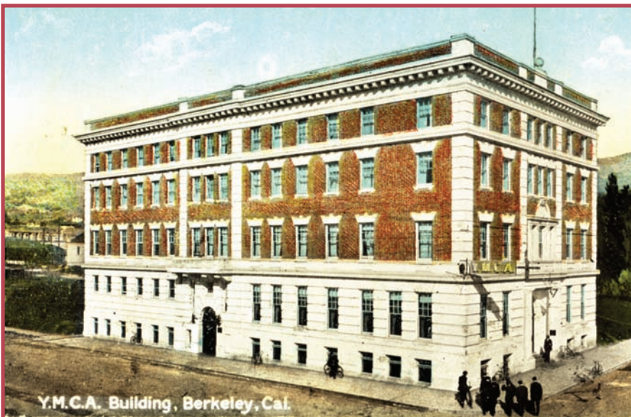
Y.M.C.A. Building, Berkeley, Cal.