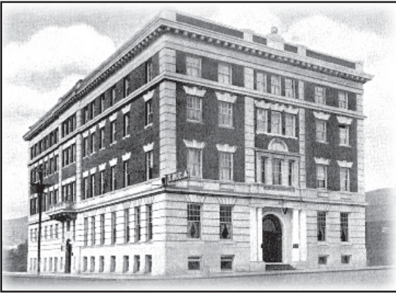
The Berkeley YMCA “the day it was built.” Historic post-card courtesy Anthony Bruce.

dations for visitors in the heart of town. The Downtown Y also operates Berkeley’s largest fitness center. In 2008, the Downtown YMCA undertook a major seismic upgrade to ensure the safety of the 17,000 Y users in the event of a major earthquake. The project included exterior rehabilitation of this City of Berkeley Landmark. With the completion of the work, the venerable Y looks as fresh as the day it was built.