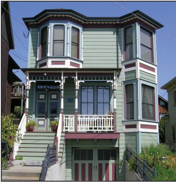
The Baptist House. Daniella Thompson, 2010.

tic addition in the rear. The house was lifted to make room for the garage in the basement, and the structure was shored up with a massive I-beam.