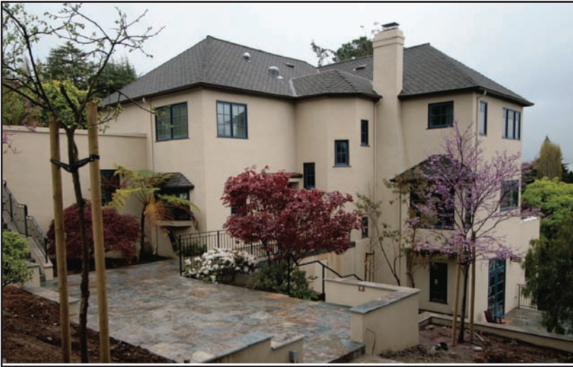
The Scheeline House. Daniella Thompson, 2010.

of the house together stylistically. Several mature trees were brought to the site so that the landscape is not dwarfed by the house in size and in age. The new patio extends the living space into the outdoors.