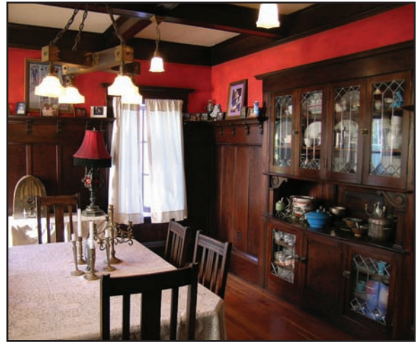
Restored woodwork in the Rickard House.

The house, has gone through a not atypical journey from single-family residence to “apartments” and back to a single-family house in its century of existence.