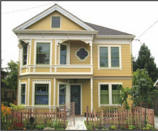
Fischel House.

one-story house had been uninhabited for two years.