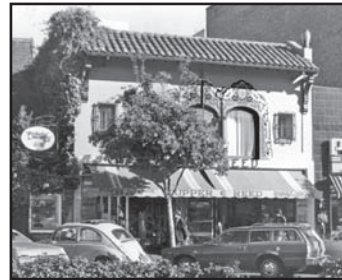
Hezlett's.