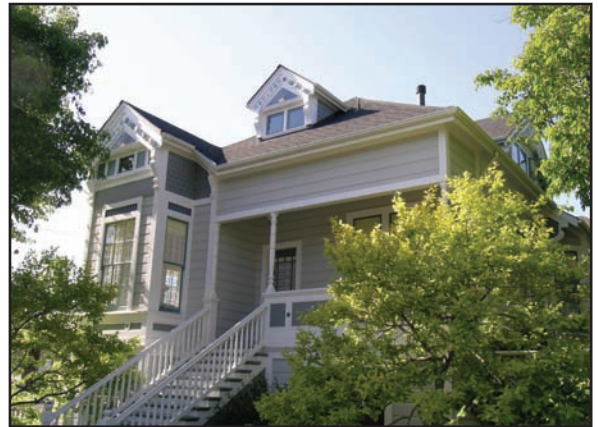
Cole House. Daniella Thompson, 2008.

Inside, the house had been divided into several studio apartments during the 1940s. The owners and Tim Larkin devised a plan that combines small Victorian rooms with an open plan. The living room flows into the dining room; the staircase is sited to the side of the dining room, and the kitchen flows to the rear of the house. An office with bay window leads off the dining room and a sitting room is to the left as one enters the house. Both these rooms can be closed off with doors. One of the