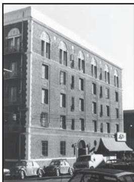
Cambridge Apartments, entrance on Durant.