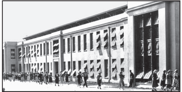
Berkeley High School Gymnasium seen after the 1937 seismic upgrade — and as it still appears today.

Deaf and Blind, and the following year was elected to the Sixty-fourth United States Congress.