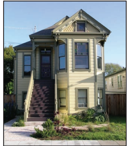
McGraw House.

Throughout, energy-efficient systems and sustainable materials were utilized. The result is a charming house that is an asset to its neighborhood. BAHA congratulates all involved on so successfully extending the useful life of this historic dwelling.