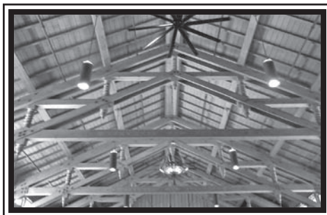
Ceiling detail, Alumnae Hall